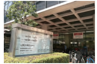
Mita Library A 3-minute walk from our school