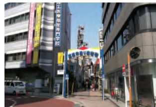
Keio Nakadoori Shoutengai (shopping street) A 3-minute walk from our school