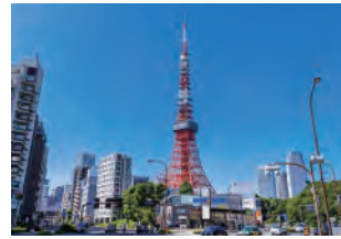
Tokyo Tower A 7-minute walk from our school