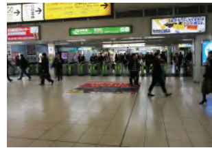
JR Tamachi Station A 5-minute walk from our school