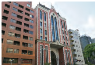
Keio University A 3-minute walk from our school