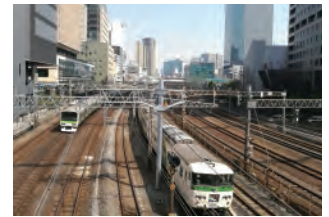
View over the train A 7-minute walk from our school