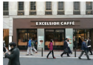
EXCELSIOR CAFFÉ Mita Store A 3-minute walk from our school