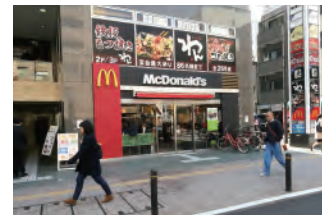
McDonald's Mita Eki-mae store A 3-minute walk from our school